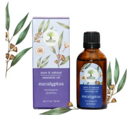
lavender oil cold relief