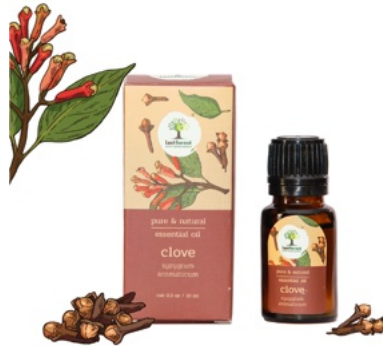
clove oil dental care