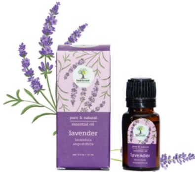
lavender oil aromatherapy