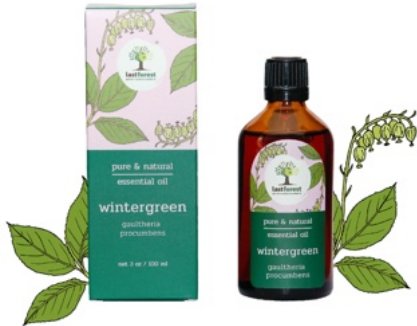
wintergreen oil pain relief