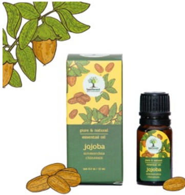
jojoba oil skin care