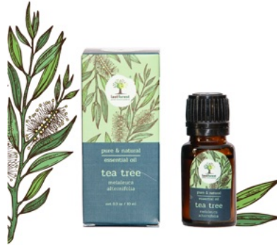
tea tree oil skin care