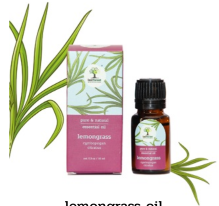
lemongrass oil aromatherapy