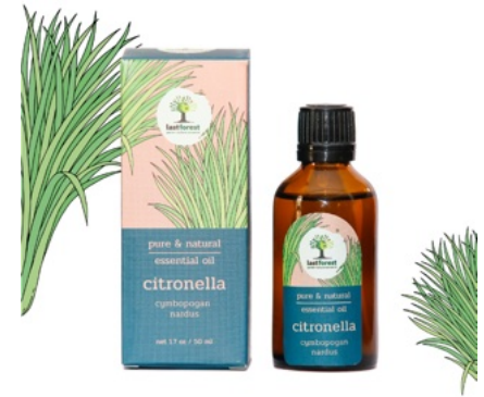
citronella oil insect repellent