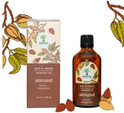
almond oil hair & skin care